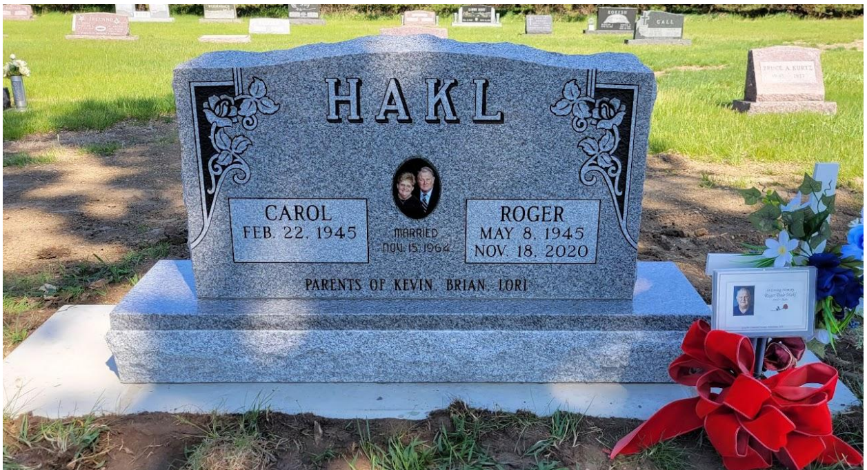
Light Gray w/2 inch polish margin (shown below)