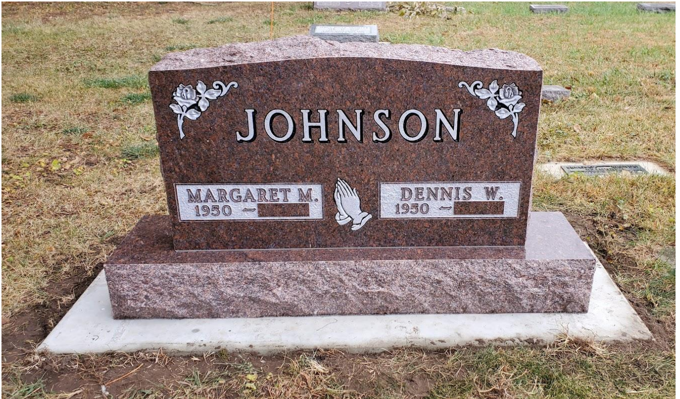
Mahogany (shown above)