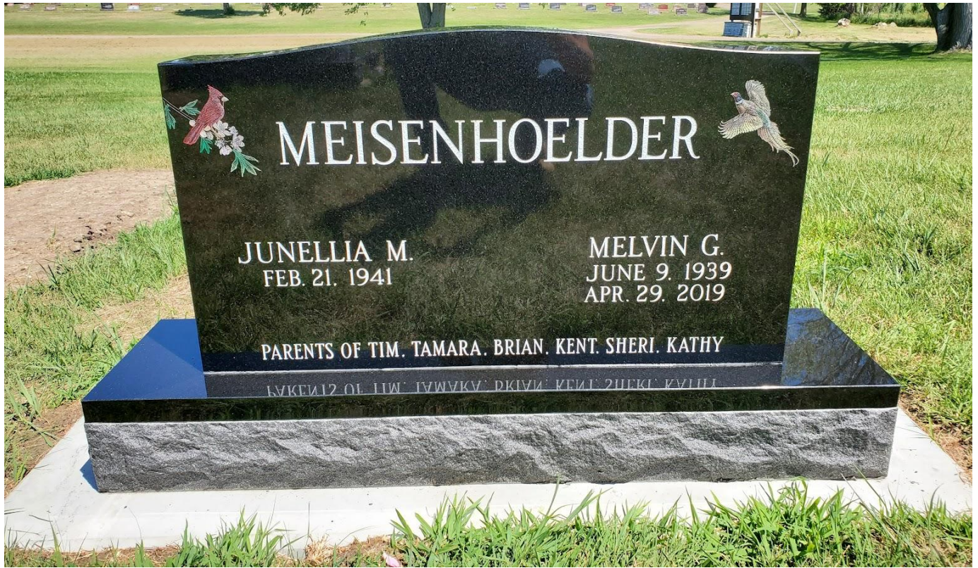
Jet Black w/2 inch polish margin (shown above) St. Cloud Gray (shown below)